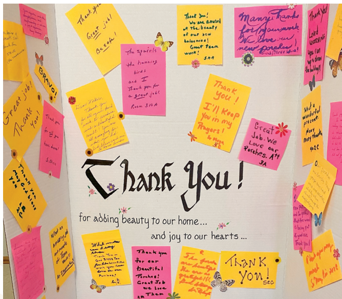
One of the "Thank You" poster boards the retired Sisters created.

If you would like to help this fundraising effort, please email sedord@sistersofihm.org or call the Development Office at 570-346-5431.